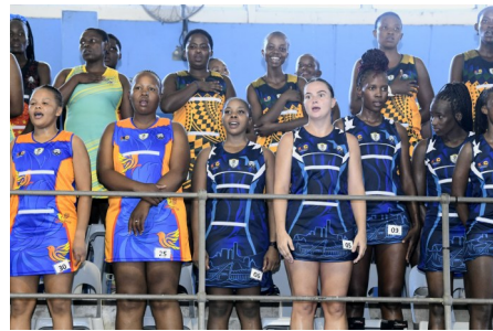
KwaZulu-Natal Netball teams

"If we are to use sport in our efforts to bring the people of KwaZulu-Natal together, all our teams and sporting codes must reflect the demographics of our province. This is how we will build a winning province and nation by bringing all