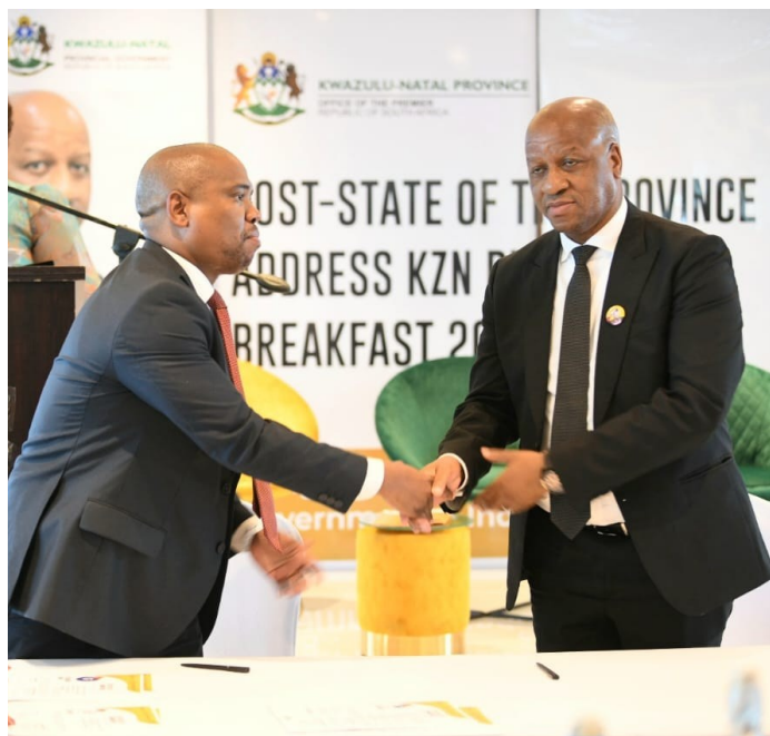
Business entities from various sectors pledged millions of Rands towards revitalizing KwaZulu-Natal's economy.