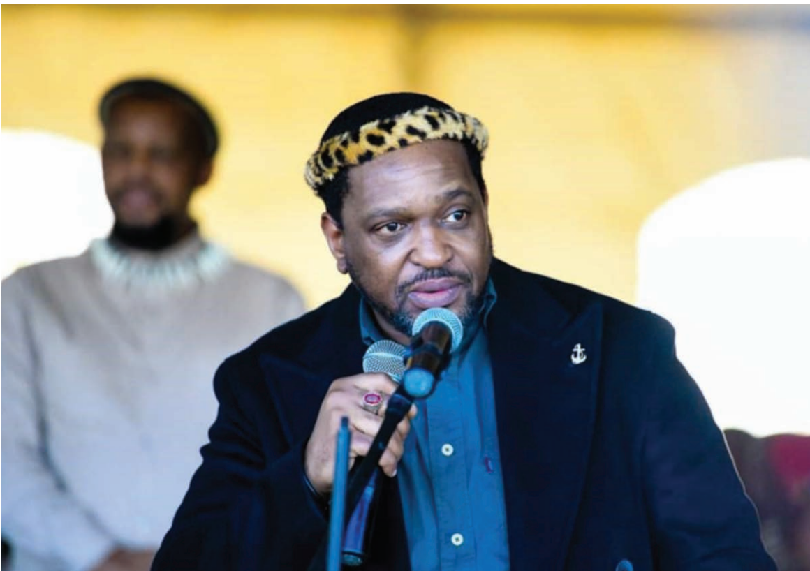
Bebephume ngobuningi omama eMkhosini Wesivavane KwaKhangelamankengane njengengxenywe yomgubho wenyanga yabesifanzane. Isilo uMisuzulu kaZwelithini sethule inkulumbo kulo mkhosi.