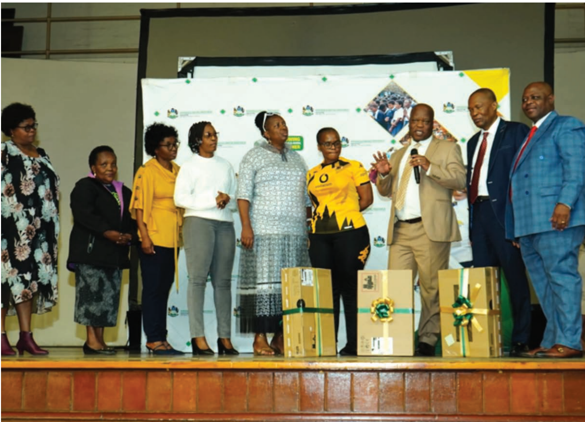
OweZeMfundo uhlomisa abafundi besilisa kwele-Mandela Remembrance Celebration

Laba bafundi bebephuma kwiziFunda uMgungundlovu, iLembe uMlazi kanye ne-Pinetown. Intshisekelo yokukhuthaza abafundi besilisa ukuthi bakukhuthalele ukufunda, ilandela imibiko yakamuva ye-Progress in international Reading and Literacy Study (PIRLS), ethi u-81% wabafundi abenza u-Grade 4 kuleli,