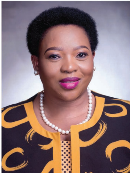
Ms Nomusa Dube-Ncube PREMIER OF KWAZULU-NATAL