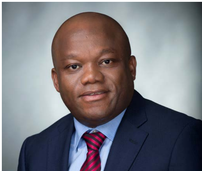
Honourable Premier of KwaZulu-Natal Mr Sihle Zikalala

Honourable Speaker, as a people, we must remain resolute in keeping our memories alive of these stark reminders of where we come from as a country and as a people. In order to keep our focus and compass solid on where we are going as a country and as a people, let me remind this house that the year 2020 is also the centenary year of two other gigantic figures of the South African struggle for liberation and human rights, the late uBaba, Raymond Mhlaba and the Lion of the Midlands uBaba, Harry Gwala. Given these brilliant reminders, it is indeed befitting to be committed to the reality that Africa is our Beginning, and that Africa is our Ending.