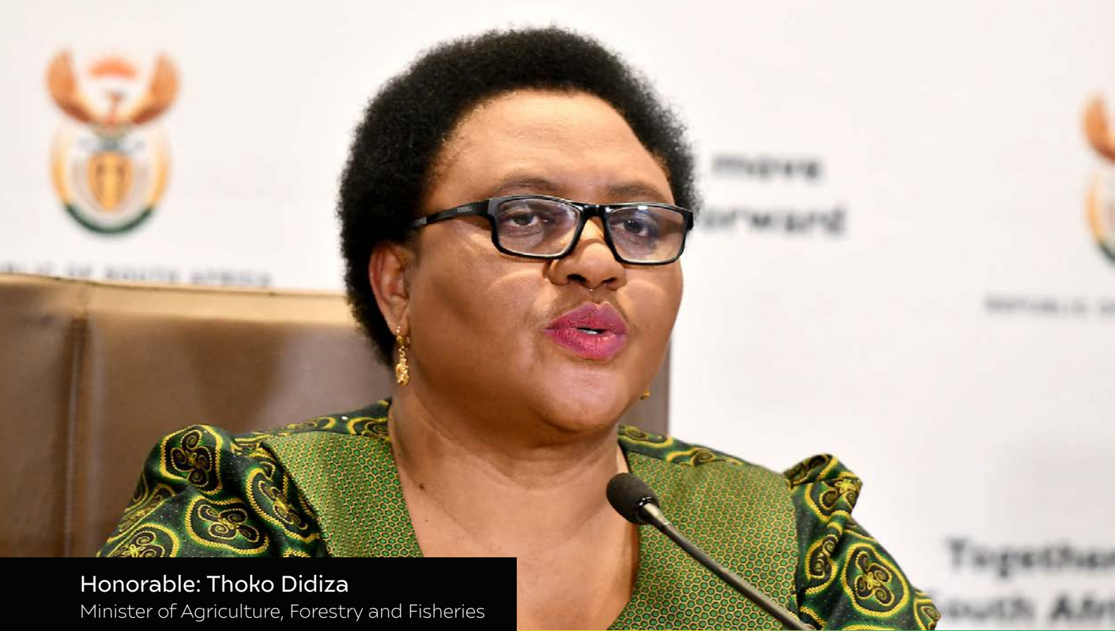
Honorable: Thoko Didiza

Minister of Agriculture, Forestry and Fisheries